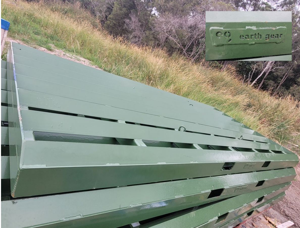
Rumble Grid Road Plate